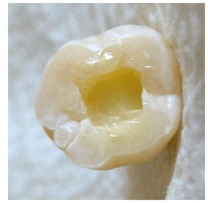
Figure 1-Standard box-shape Class-I cavities (4×4 mm wide, 4 mm deep)

Consequently, the first aim of this study was to evaluate polymerization shrinkage by dye penetration and the second aim is to evaluate the effect of cure depth by microhardness test in the bulk fill resin material using two different insertion techniques. The null hypothesis was that the shade and insertion technique of the bulk fill resin composite would not interfere with the marginal microleakage and depth of polymerization.